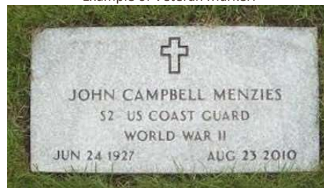
Example of Veteran Marker:

The cemetery is located at Main and Kohler streets in the City of Tonawanda. It is maintained by a staff of volunteers who always welcome new members.